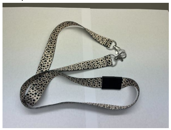
Product (provided by client)