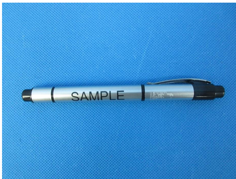
Fig.1 (Finished photo)