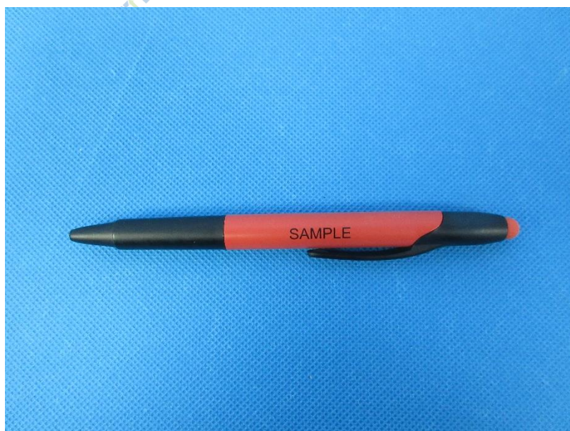
Fig.2 (Finished photo)